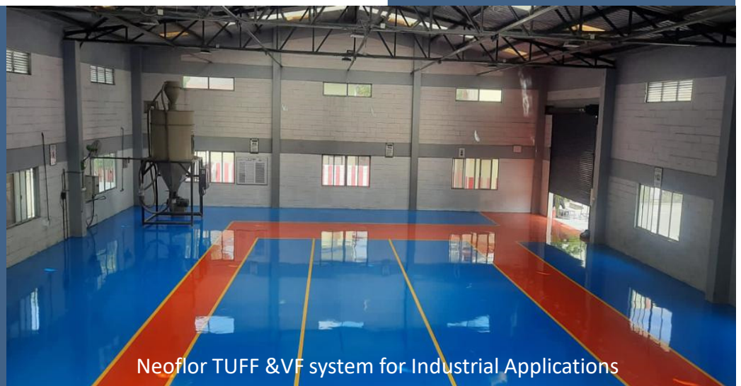
Neoflor TUFF & VF system for Industrial Applications

email: neocrete@gmail.com Website: www.neocrete.co.in