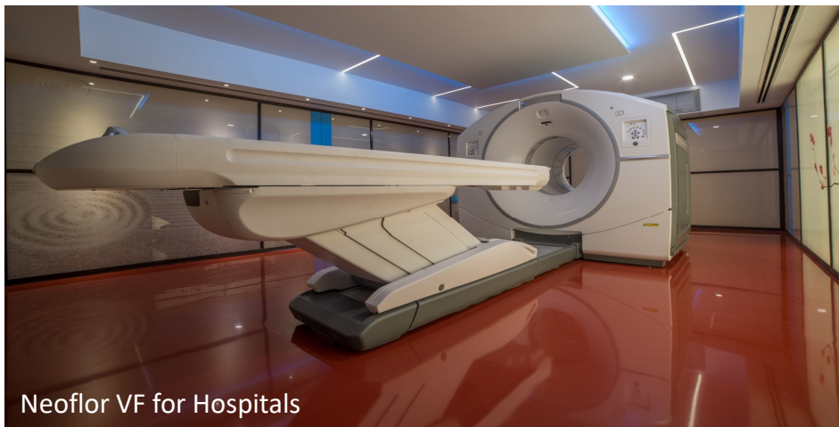
Neoflor VF for Hospitals

Beginning with a modest range of products with a few customers, Neocrete has grown over the years, now offering more than 150 products for a variety of industries such as electronics, aviation, pharmaceuticals, automobiles, textiles, light & heavy engineering industries and alike.